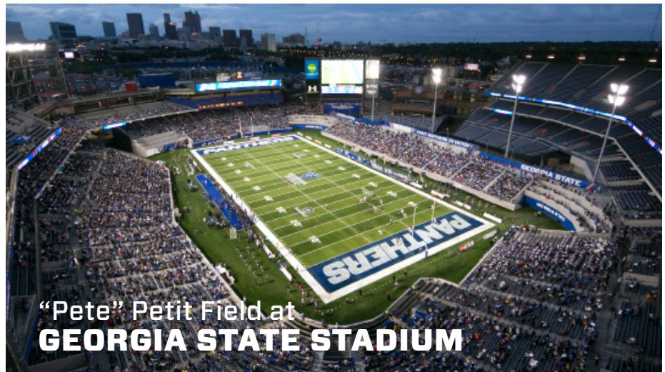
"Pete" Petit Field at GEORGIA STATE STADIUM

A RECORD FOR RECORDS: The Panthers enjoyed the most prolific offensive day in GSU history and also reached milestones on defense and special teams in their 47-37 win at ULM (Oct. 14):